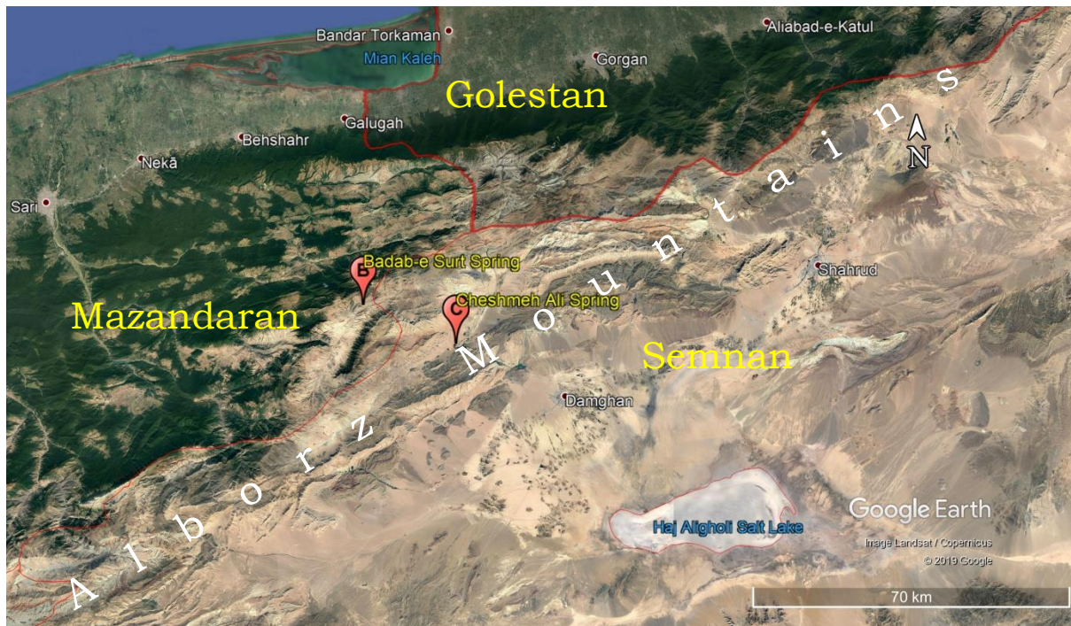
Figure 3: Satellite view of Haj Aligholo Playa, Cheshmeh Ali and Badab-e surt springs