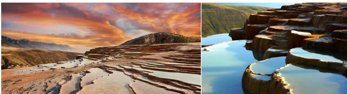
Figure 4. Badab-e Surt Spring

BSs (Figure 4) is including two springs, one with the saline and the other spring water has a sour taste and orange color. They formed during Pleistocene and Pliocene, by the time the discharged cool bicarbonate-rich waters from these springs has resulted in the formation of red, orange and yellow travertine terraces with crystalline crust, pisoid, tufa, and carbonate black muds lithofacies (Sotohian and Ranjbaran 2015).