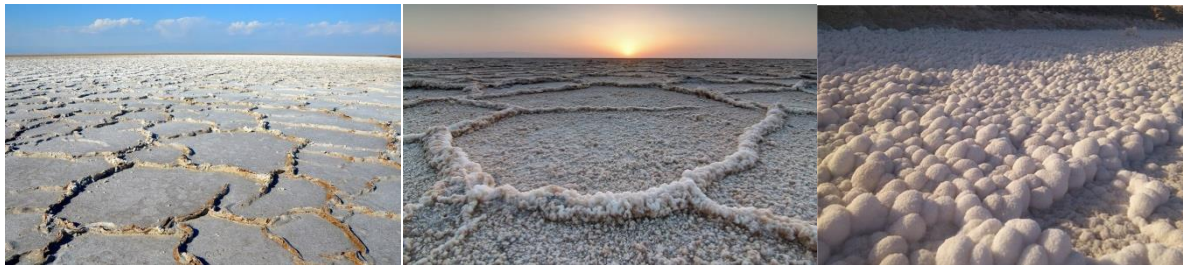
Figure 5: Damgan Salt Playa

Discovered Upper/Epipaleolithic periods settlement evidences in the area indicating that climate during the late Pleistocene was different from than present (Vahdati Nasab and Hashemi 2016).