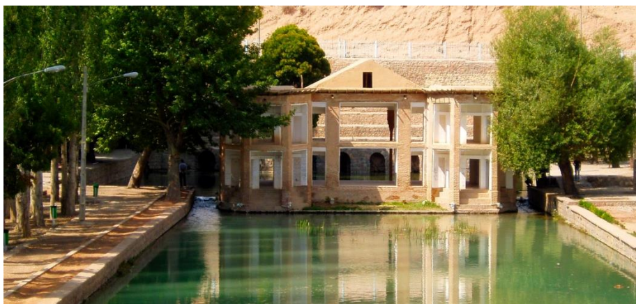
Figure 6: Cheshmeh Ali and the constructed palace

The biggest karstic spring in Semnan province called Cheshme-Ali (CAs)(Figure 6) is located at 30 km of NW Damghan and is one of Damgan desert catchments. CAs water discharge is 500-700 l/s and which provides drinking water for part of Semnan city and 25 nearby villages. Average annual precipitation of the CAs watershed is 155 whereas the number for the evaporation is 1900 mm. Geologically CAs is a part of eastern Alborz zone which is combination of the thick Delichae and thin Lar calcareous formations (Hosseini et al. 2018).