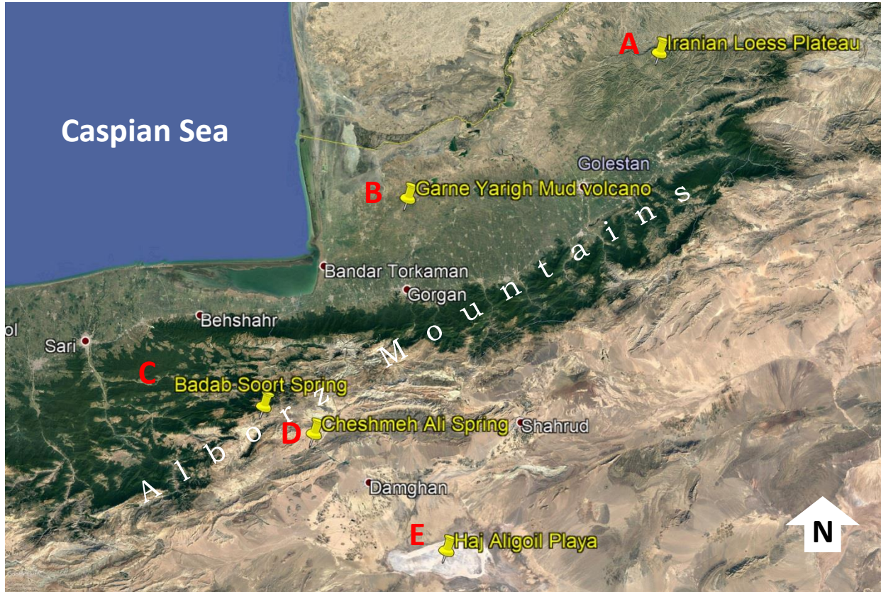
Figure 1: Google earth view of the excursion sites

During excursion, the Caspian Lowlands, the Iranian Loess Plateau, the Alborz Mountains and the northernmost part of the Central Plateau will be visited (Figure 1).